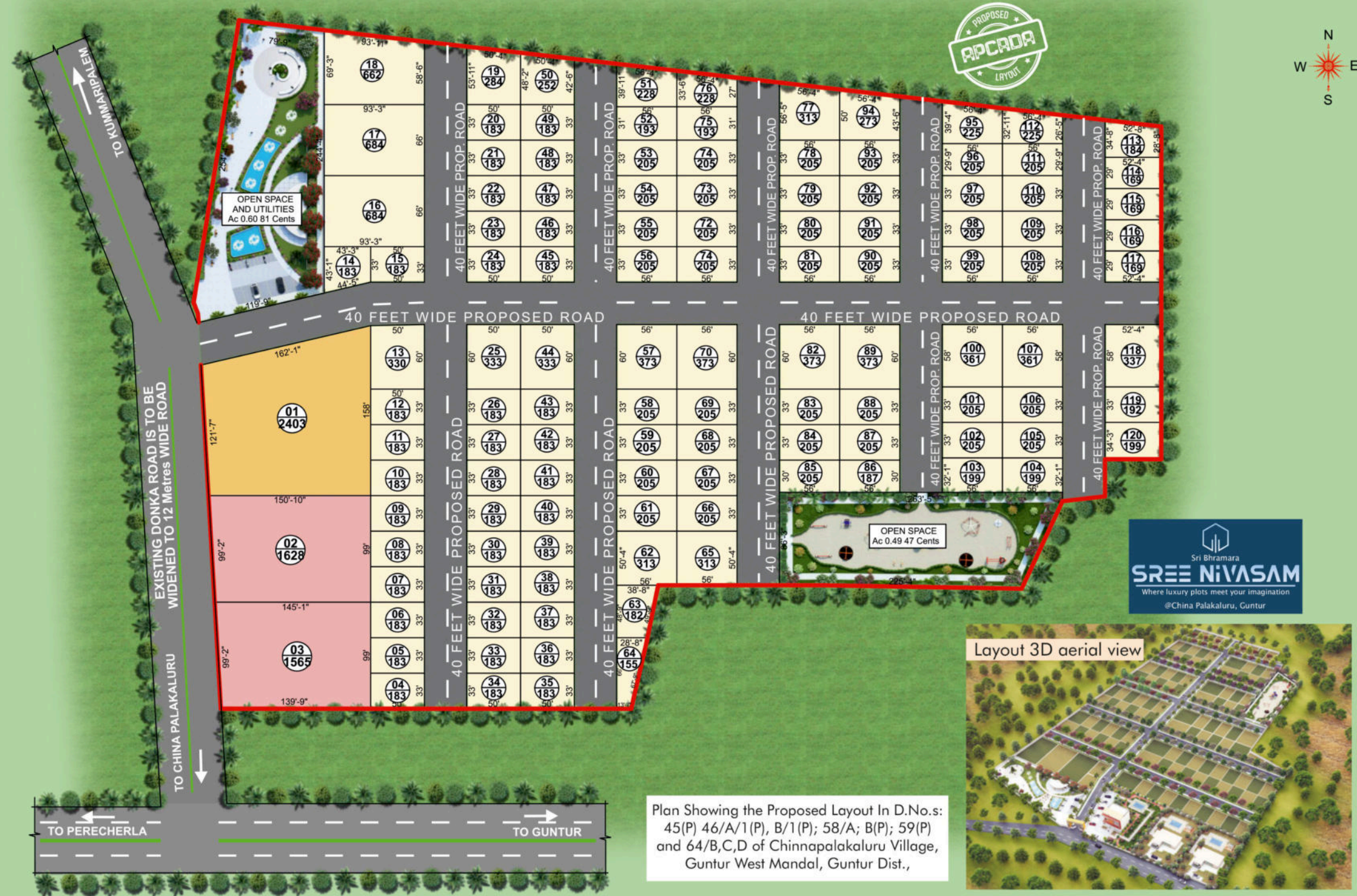
Plan Showing the Proposed Layout In D.No.s: 45(P) 46/A/1(P), B/1(P); 58/A; B(P); 59(P) and 64/B,C,D of Chinnapalalaluru Village, Guntur West Mandal, Guntur Dist.,