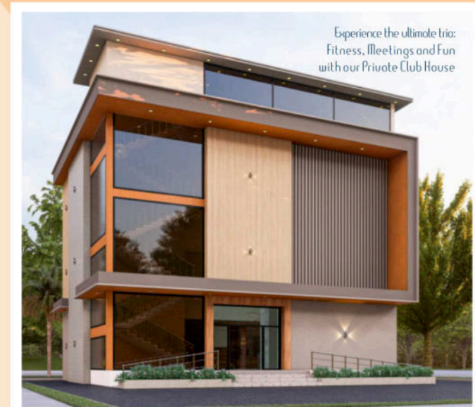
Experience the ultimate trio: Fitness, Meetings and Fun with our Private Club House